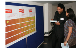
A national voice for the Black and Minority Ethnic voluntary and community sector