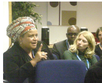
A national voice for the Black and Minority Ethnic voluntary and community sector