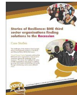
A national voice for the Black and Minority Ethnic voluntary and community sector